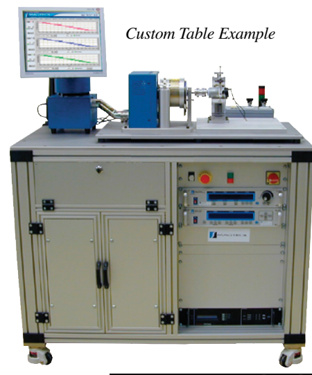
See page 2 for descriptions of indivdual table models.